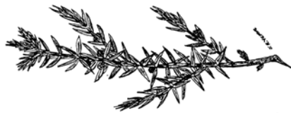
JUNIPER (Juniperus Communis).