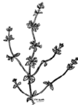
WILD THYME (Thymus Serpyllium).