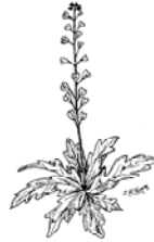
SHEPHERD'S PURSE (Capsella Bursa-pastoris).