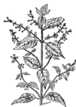
SCULLCAP (Scutellaria Lateriflora).