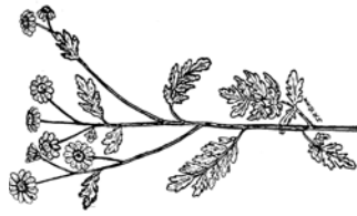
FEVERFEW (Chrysanthemum Parthenium).