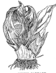
SKUNK CABBAGE ( Symplocarpus foetidus ).

In hot fomentation this herb may be applied with good results over the lungs, stomach or abdomen in cases of either congestion or inflammation.