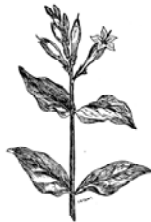
INDIAN PINK ( Spigelia marilandica ).

The fluid extract and the resinoid producing headache as they do, cannot be used in large quantities, sufficient to produce the required alterative effect, but of the syrup you: can give as much as is required. It acts well on the secretions throughout, the liver, kidneys, and lymphatics. It does well in all bad contaminations of the blood. It is a good remedy in syphilis. If it attacks the joints apply a strong infusion of cimicifuga to the parts. The syrup of cimicifuga makes an excellent base for other alterative preparations, tonics and antispasmodics. It tones and prevents waste, soothes and stimulates the nerves; is a good antispasmodic and is useful in whooping-cough, asthma, hysterical convulsions, hysteria and chorea.