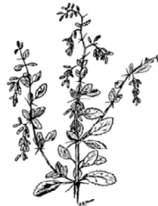
BARBERRY (Berberis Vulgaris)