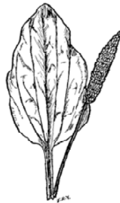
PLANTAIN (Plantago Major).

Baptisia is stimulating to the liver and to the bowels and in large doses is freely cathartic. In typhoid fever, in peritonitis, in puerperal fever, typhus fever, syphilis and gangrene it is very valuable; also as a wash for mercurial sore mouth. The powdered drug in hot fomentation will give good results when applied upon scrofulous swellings or abscesses. In arresting putrescence balsamodendron myrrha will be a valuable addition.