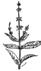
PEPPERMINT (Mentha Piperita).