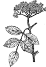
ELDER (Sambucus Nigra).