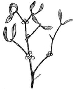
MISTLETOE (Viscum Album).