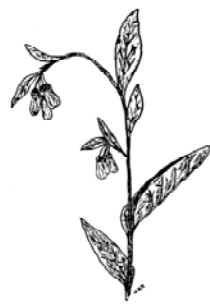
COMFREY (Symphytum Officinale).