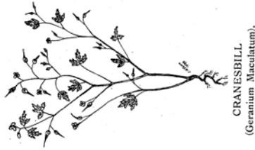
CRANESBILL (Geranium Maculatum).