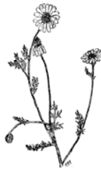
CAMOMILE (Anthemis Nobilis).