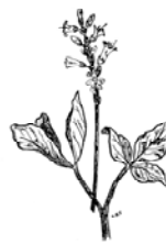
BOGBEAN ( Menyanthes trifoliata ).

Cimicifuga Rac. Caulophyllum Thal. Cypripedium Pub. Helonias Leonurus Card. aa. equal parts. Or Cimicifuga Rac. Juristolochia Serp. Asclepias Tub. Lobelia Infl. aa. equal parts.